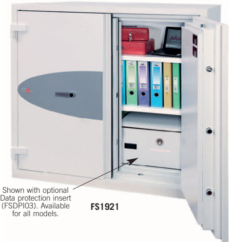
Shown with optional Data protection insert (FSDPI03). Available for all models.