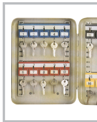
Bronze System 20