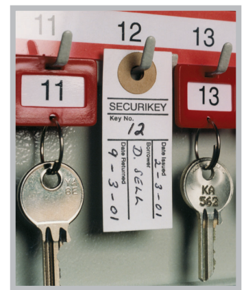
Key Sign Out Tab

A range of Cabinets to control and track keys