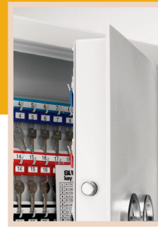
Door Slab and Locking Bolt

Whilst being equipped in the same manor as the bronze range for key control and organisation the similarities stop there. The high security range meet our Gold grading and offer the ultimate in protection. The construction is based upon the technology used to manufacture cash safes and offers 3 way bolt locking and a 6mm steel slab door. Equipped with an approved safe lock, this range is the best available in today's market.