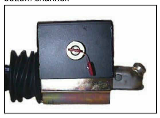
5. Insert locking bolt.