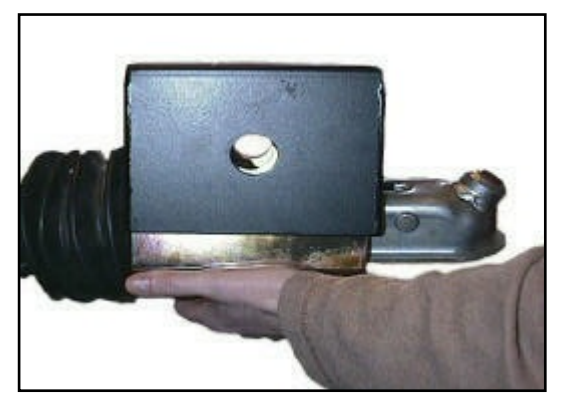
4. And lower until holes in both line up.