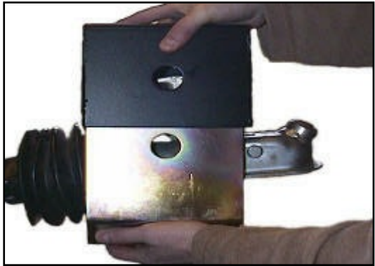
Place powder coated top box over bottom channel.