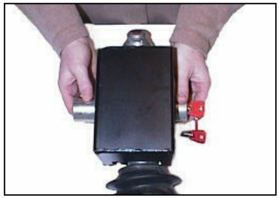
6. Push cup over end of locking bolt. turn key quarter turn clockwise to lock and remove key. Fit red plastic cover.

We have taken every care in the design and manufacture of this security device and we believe that it is an effective deterrent. However we cannot guarantee that it will resist the efforts of the most determined thief and as such we do not accept any liability for loss or damage caused by theft, vandalism or other illegal activity against property to which this device is fitted.