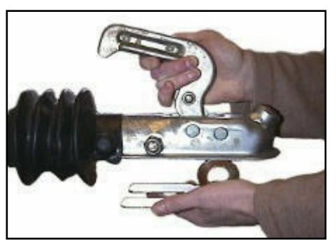
Insert dummy ring plate. If hitch handle is in raised position the plate can be used to release handle.