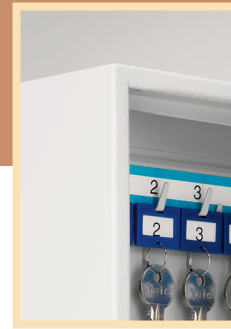
1.5mm pressed steel body

The Securikey System Cabinets are graded in our Bronze category. This range are manufactured to meet the needs of both domestic and light commercial applications. They provide the facility to control and track keys from 20 to 2080 in number and are used extensively throughout businesses worldwide. The cabinet is secured with a very high quality Securikey cam lock as standard and forms the entry level for our large range of key control systems.